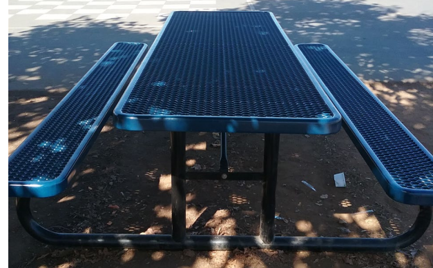
Rectangle Shape Outdoor Table, 8 ft. long, Seats 10-12

Can be used outside the classroom(s) for outdoor learning if space is available, may also be used in lunch area(s).