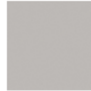
Fashion Grey #D381-01 Laminate

Activity Table, Nest shape, 30"W x 54"L, (adjustable height 22"-30"H) , Dry Erase Surface with black band edge, (2 placed together make a round table)